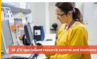
26 JCU specialised research centres and institutes

https://www.jcu.edu.au/events/2019/august/jcu-application-based-programs-webinar