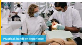
Practical, hands-on experience